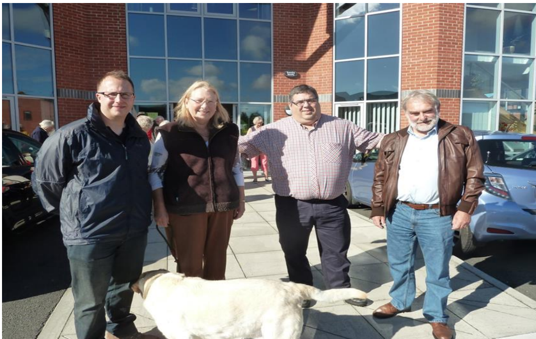
Members of the Scrutiny Task Group setting out on a Health Walk in St Peters, Worcester.